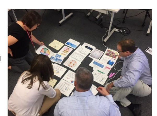
Planning Associates synthesize elements of Teambuilding & Leadership course